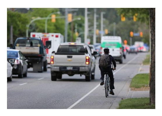
Every weekday, the residents of Kelowna collectively drive 1.7 million kilometers (that's equivalent to four times the distance to the moon!)

The reality is many residents are living in areas where their only practical option for getting to work, school or services is to use a car. These neighbourhoods, described as "car-dependent," lack sufficient population density to support effective transit service and are too far away from destinations or too hilly to make walking or cycling convenient options. Since households in these areas must drive to meet their daily travel needs, often from the edges of the City, the data show that over 90 per cent of residents travel by car to work i and also drive 2-6 times farther, iv compared to households in Kelowna's core neighbourhoods. Consequently, these cardependent areas contribute disproportionately to the traffic congestion experienced on our City's roadways, especially during the morning and afternoon rush hour periods.