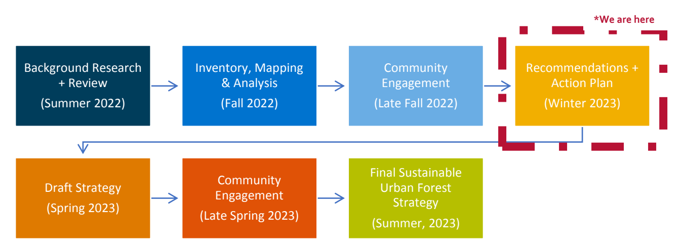
Figure 2: Timeline for developing the Sustainable Urban Forest Strategy Update